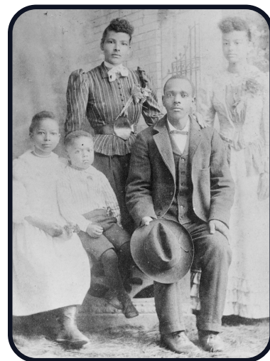
Atlanta, ca. 1885. ful0351