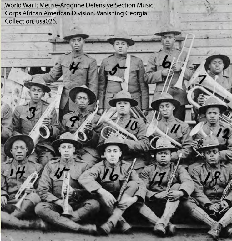
World War I. Meuse-Argonne Defensive Section Music Corps African American Division.

1:00 am – 4:00 pm Reference Library Orientation and Independent Research