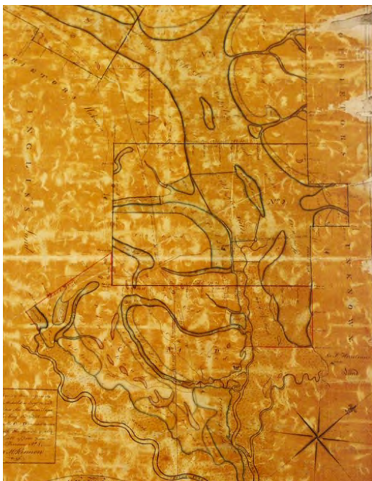
The images of before and after conservation treatment show a dramatic difference.

Many subtle colors were uncovered as Michelle cleaned the map surface. Drawn oval areas described the crops, homesteads, forests, and single trees, all carefully drawn on the map. After the surface shellac was removed, residual adhesive was cleaned from the back where the linen had been adhered. Mold damage was treated, and the areas of loss on the right edge were repaired with Japanese tissue.