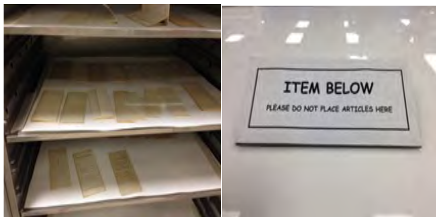
The documents spend some time in the humidifying chamber and then get weighted down overnight. Then they are safe to use.