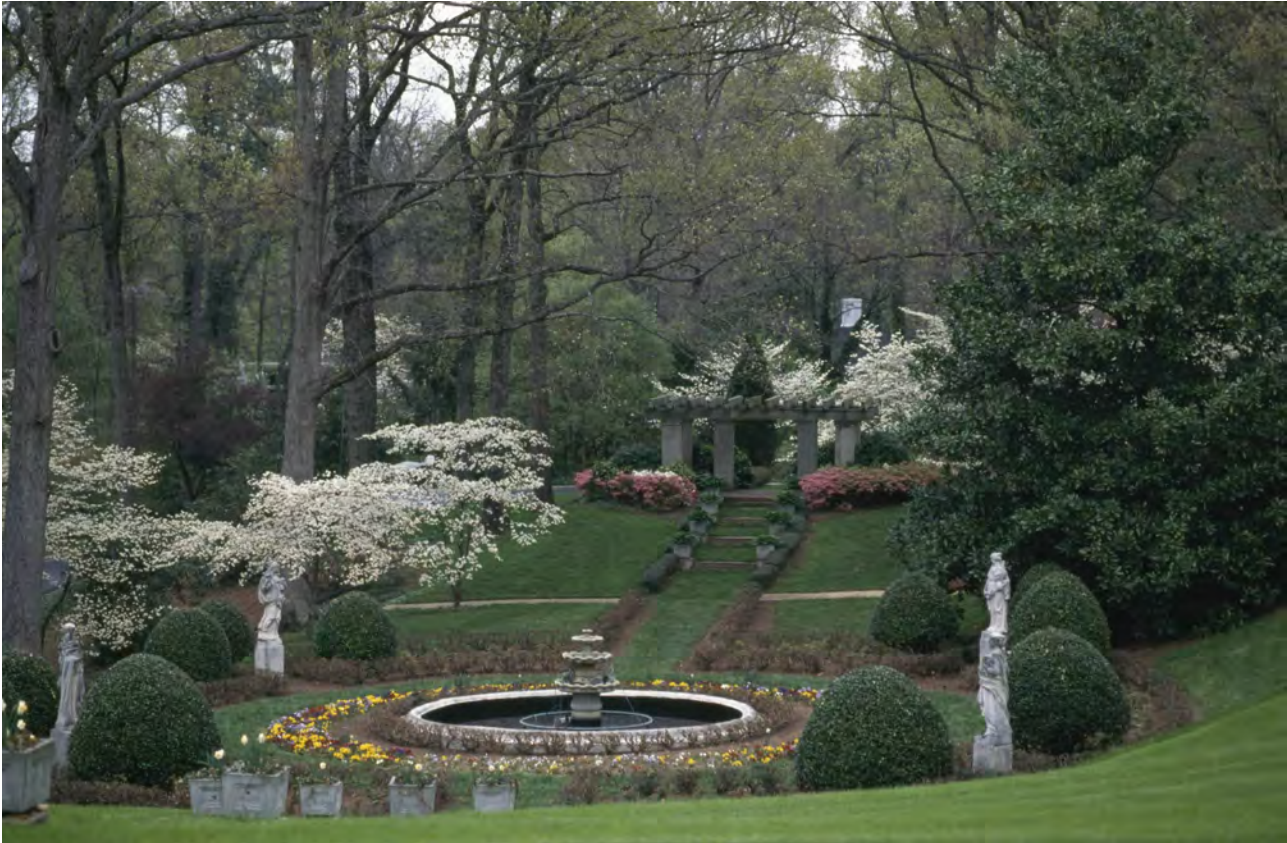
Georgia Governor's Mansion, Atlanta.