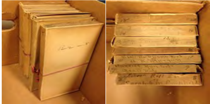
The files were folded into thirds and stored in very acidic brown boxes, which actually protected them in the long run from dust and dirt.

Once flattened, each batch was organized into estate files, and placed into folders. Once a box was filled with flattened documents, an Excel spreadsheet was created, documenting the names involved in the files. The metadata was put into the Finding Aids section of our Georgia Archives website, and the records are now searchable by family names. The project took about 14 months and now takes up 23 boxes, which can be viewed at the Georgia Archives.