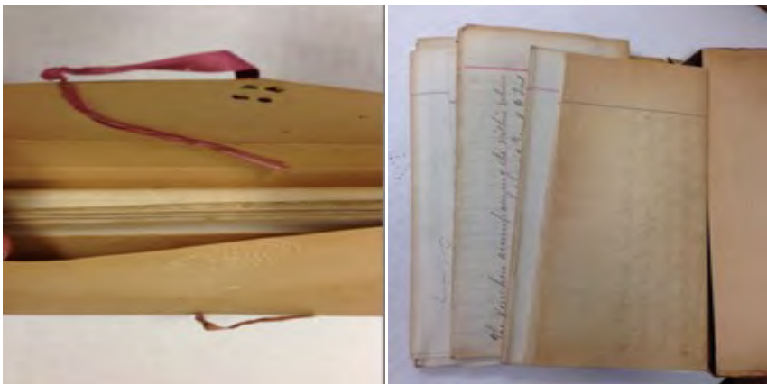
It would be harmful to handle documents that were folded for so long.